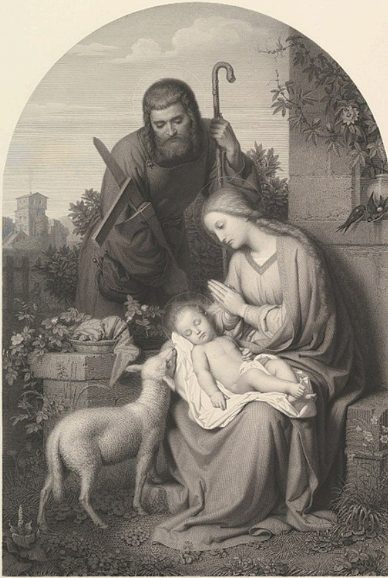
Franz Ittenbach, 1813-1879