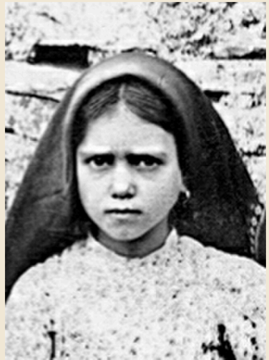
February 20th: Saint Jacinta Marto