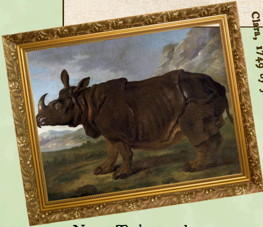
Clara, 1749 by Jean-Baptiste Oudry